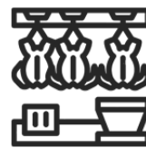
Chicken Processing Plants