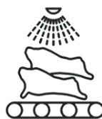
Meat processing plants